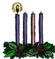
First Sunday in Advent